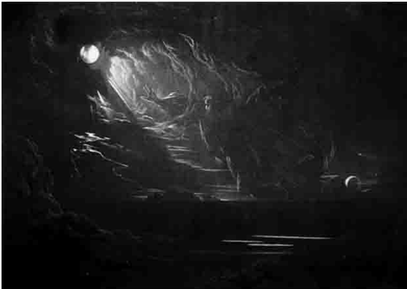
Creation of light. John Martin. 1827